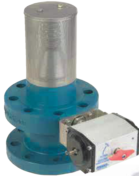
TA3217RA and Pneumatic Actuators